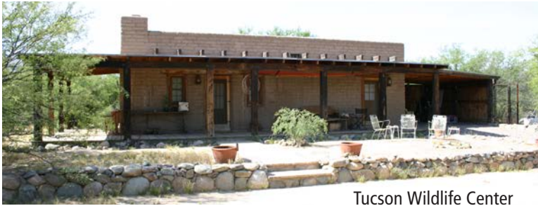
Tucson Wildlife Center