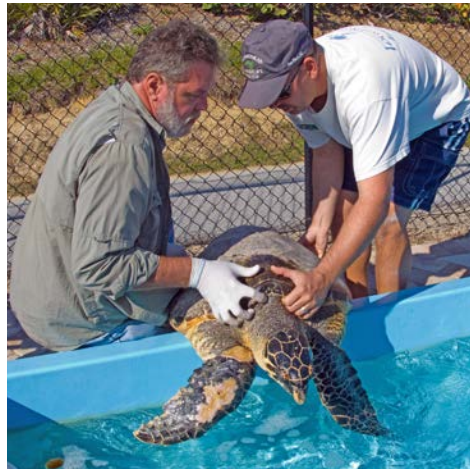
Animal caretakers treat a sea turtle for injuries to its right flipper.

These wildlife rehabbers have special training in many areas. They are nutritionists with expertise in what and how much to feed different species of animals. They are behaviorists, meaning they have studied the behavior of wild animals and can understand and predict what a specific animal will do in various situations. They are animal-housing specialists who know exactly the type of cage, pen, or other enclosure to use for different species of animals, especially when an animal is injured and needs a particular kind of shelter to heal safely.