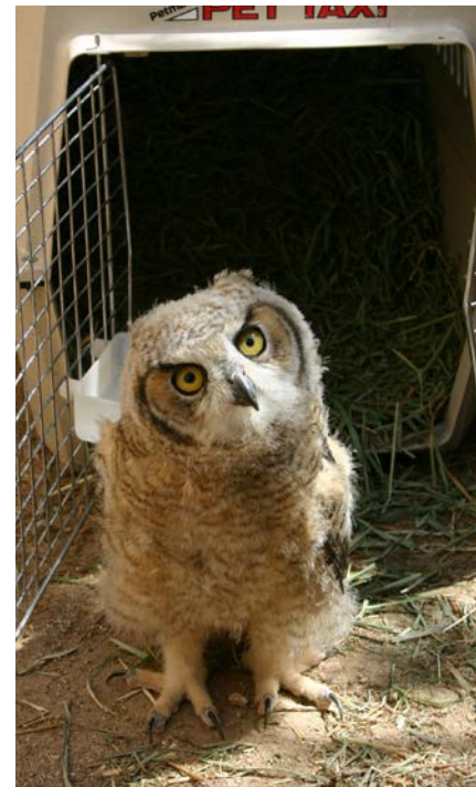
Topsy, a three-month-old female great horned owl, was rescued after she fell out of her nest during a windstorm. She is healing from neck and back injuries.

Many people don't know what actions to take, or not to take, when they find wildlife that may be