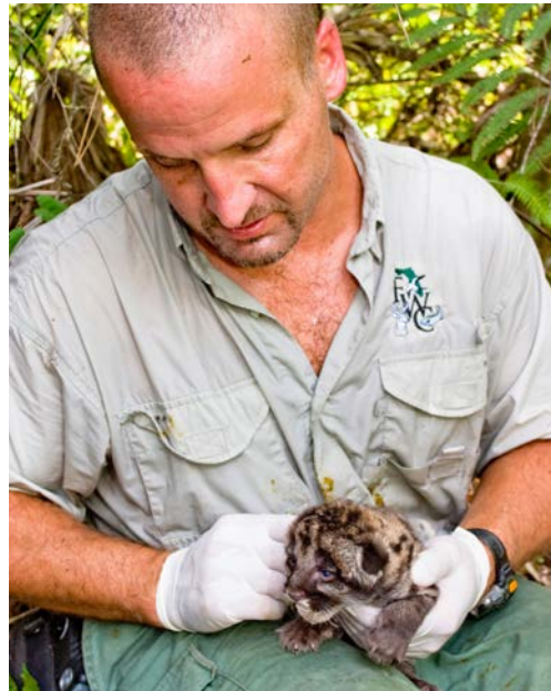
A Florida state wildlife worker examines a panther kitten.

Most wildlife rehabbers work with animals that are indigenous , or native to the region where the rehabbers work and live. They have special permits and licenses to treat these animals. To work with exotic animals, which are non-native animals that have migrated or been brought to the region, a rehabber requires special training with those animals as well as special licenses and permits.