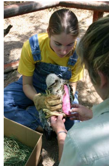
A volunteer holds a baby red-tailed hawk while a rehabber takes off a bandage. The hawk broke a leg when it fell out of its nest.

How do people become wildlife rehabbers? Many start as volunteers who learn how to care for animals in the homes and backyards of rehabbers with special wildlife training. Volunteers do not get paid for their work, but