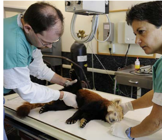
Veterinarians examine a red panda.

clean place that had the right equipment and medicine to help you. Like you, wild animals deserve the best care available.