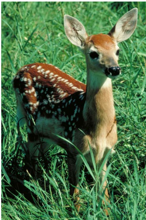
Unless baby animals are wounded, they do not need to be rescued.

People sometimes think they are rescuing baby rabbits, seals, and deer when these animals aren't in trouble. It's normal for babies of these species to rest quietly on a beach or in the grass while their mothers eat nearby. Only people trained in the natural ways of these animals know whether the babies need human assistance; if they don't, taking them from their mother hurts their chance of survival.