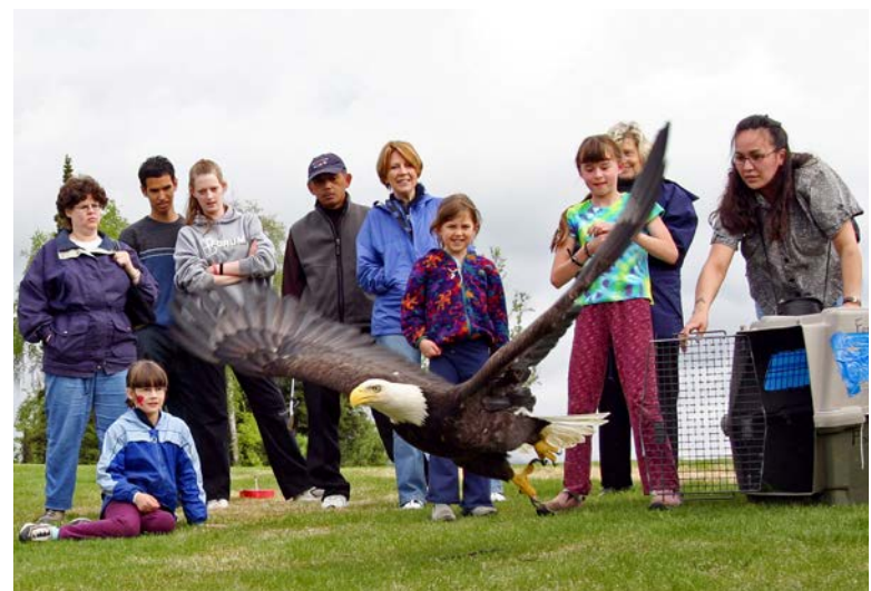
A wildlife rehabber has some company as she lets this bald eagle fly.

Slow release is often used with young animals, especially orphans. Rehabbers put a pen in a safe place in the wild with the door left open so that the animal can return to it. Rehabbers provide food for the animal until it is clear that the animal can find food for itself. Fast release is often used with wild animals rescued as adults. These animals already know how to live on their own in nature. They are taken to a release location, ideally near where they were found, and are let go.