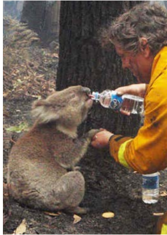
An animal rescuer gives water to a koala he saved from a fire.

Adults can help by calling a wildlife rehabber who is trained in wildlife rescue. You can help by watching from a safe place to see where an animal hides so that rescuers can find the animal when they arrive. Putting a box or laundry basket over an injured small animal will protect it from predators until help arrives.