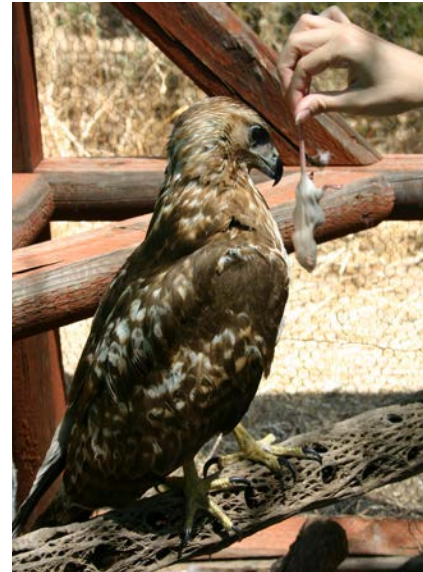
A volunteer feeds a mouse to an adult red-tailed hawk that is almost completely blind.

Baby animals imprint on their mothers at an early age; a baby duck learns that it is a duck by watching its mother every day. Wildlife rehabbers take special care not to let baby birds imprint on people; otherwise, the babies will grow up thinking they are human and will seek out humans instead of their own kind. Raptors, or birds of prey, and other birds that have imprinted on people may become dangerous in the wild. They may seek attention from a hiker who doesn't know they are used to human contact. The hiker or the bird could get hurt in the meeting. For this reason, the birds often cannot go back to the wild.