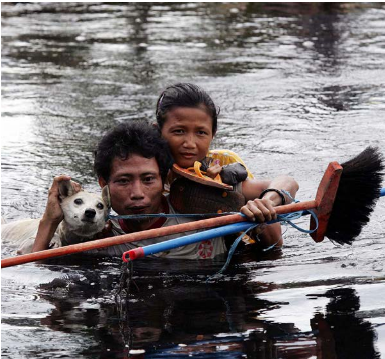
A man carries his daughter and dog to safety after the tsunami in December 2004.

Incredibly, many wild animals knew to run inland before the 2004 Asian tsunami hit land; however, pets and farm animals did not fare so well. Several people in the areas hit by the tsunami depended on working farm animals; many of these animals were killed, injured, or left in devastated areas without food. The Humane Society International worked with other organizations and volunteers to help the animals—and the people who cared for them—get their lives back on track.