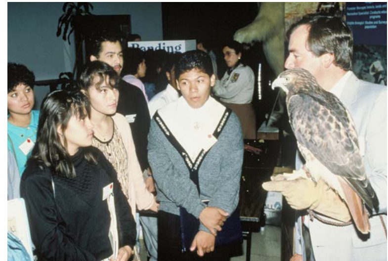
This bird of prey acts as an ambassador to teach children about animals in their area.

Wildlife rehabbers do important work in caring for injured wild animals and returning many of them to the wild. You can help rehabbers' efforts by respecting wildlife and by calling a rehabber if you see an animal in distress. One phone call might give a wild animal the opportunity to grow up and live a free and healthy life.